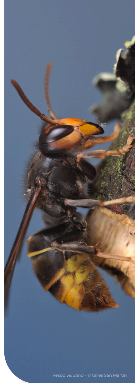
Vespa velutina - © Gilles San Martin