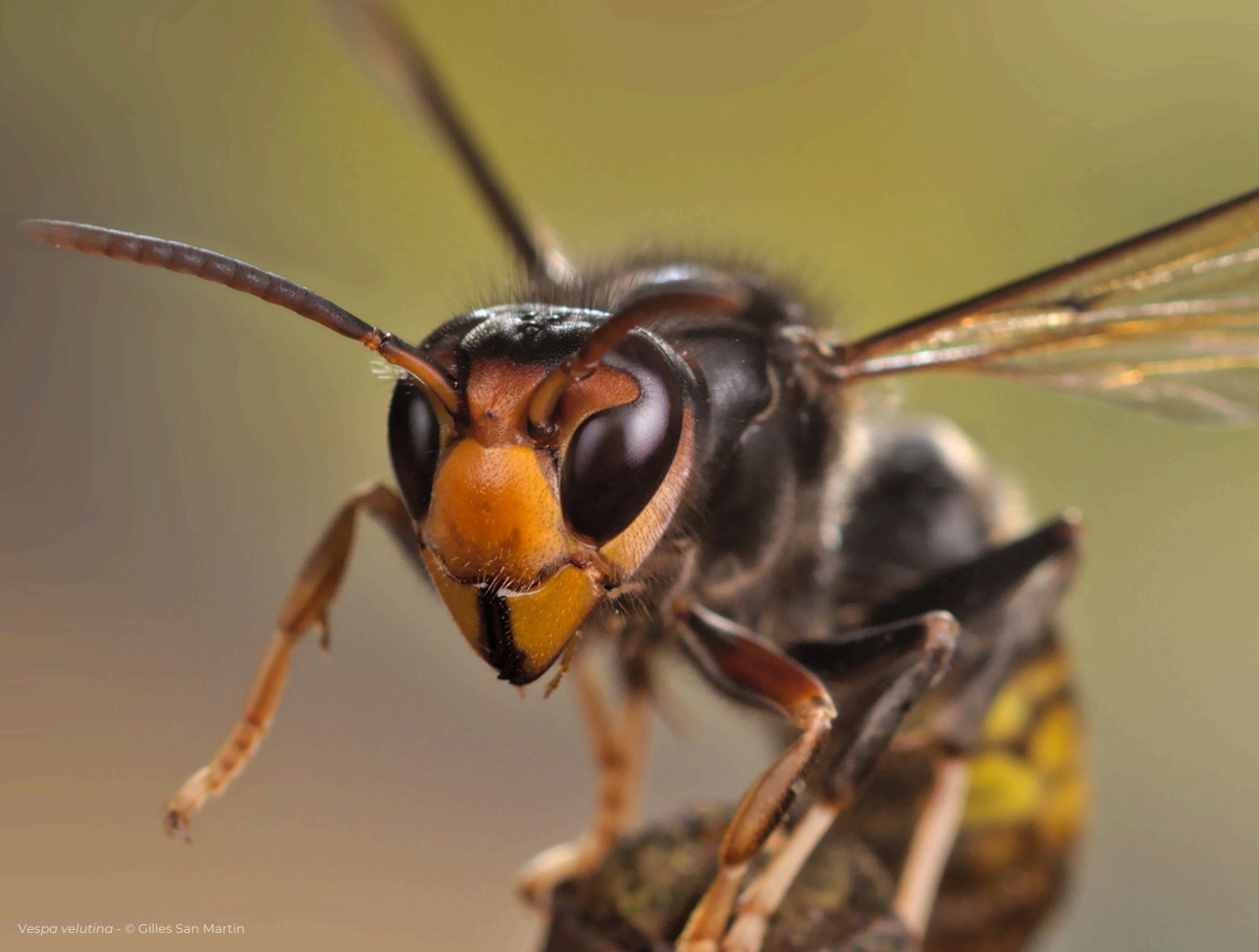
Vespa velutina