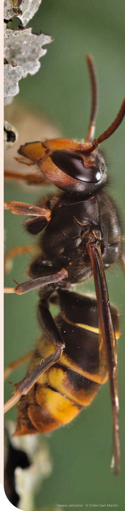
Vespa velutina - © Gilles San Martin

In addition, and in line with the previous section, V. velutina could pose a health risk to harvest workers and tourists in wine-growing regions, for example, due to its sometimes massive presence.