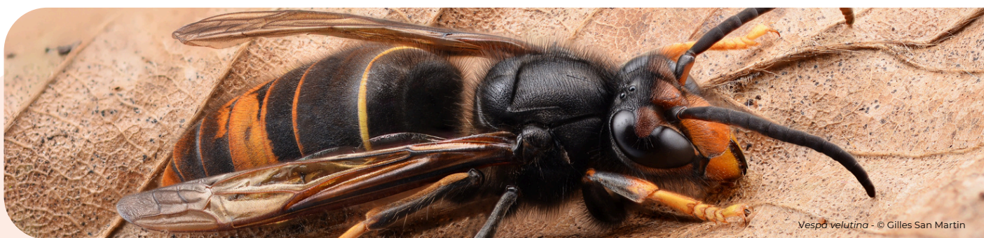
Vespa velutina - © Gilles San Martin